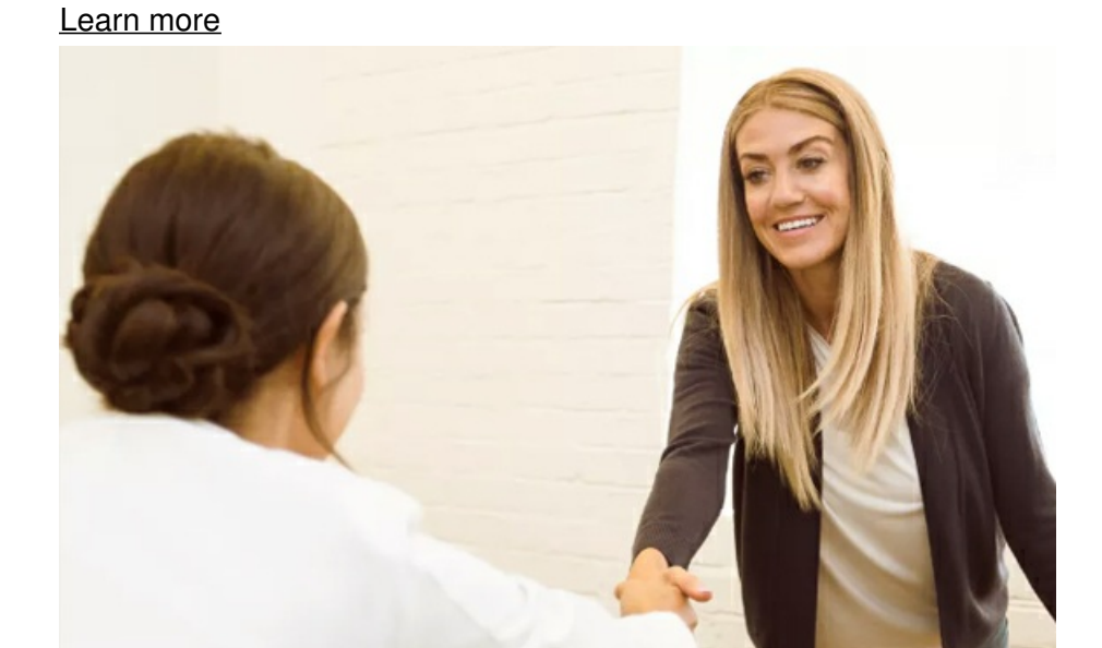
Life in the Starring Role — a website that helps people with multiple sclerosis