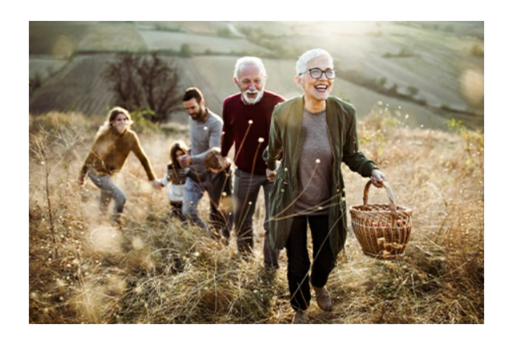
Hand on Heart — a website that helps people with heart failure